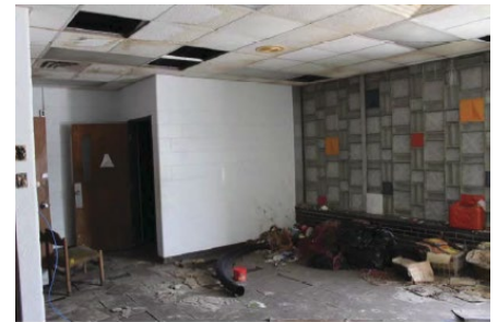
Room within the property building

The vacant portion of the facility has become blighted, with multiple nuisance complaints. It sits at a major intersection downtown and creates the perception of abandonment. The city has identified the property as a historic restoration possibility, but the 1960s portion has dissuaded purchasers.