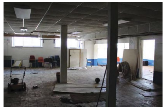
Basement common area within property building

Site Address: 480 S 3 rd St, Clinton, IA 52732