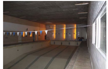
Pool within the property building

In 2018, ECIA was able to assist the City of Clinton and used U.S. EPA Brownfield Assessment grant funding to have a Phase I environmental site assessment completed on the property. The Phase I assessment recommended further testing/sampling for contaminants such as asbestos and lead-based paint to determine if an environmental cleanup was necessary on the site.