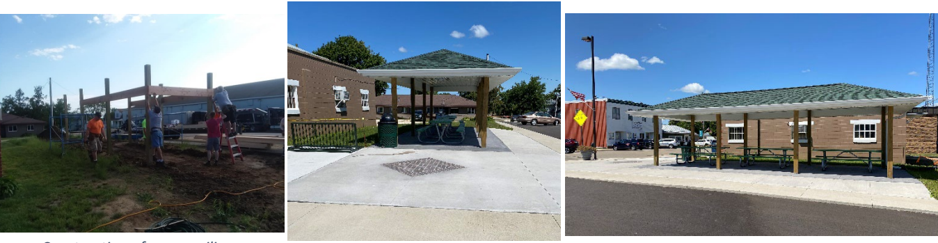
Construction of new pavilion

The city obtained a grant from Future Foundation of Delaware to create a corner street park pavilion for use as a pocket neighborhood park/community gathering space for community events such as farmers market. New sidewalks have been installed on the site along a bike rack, three picnic tables, a pavilion and a bus stop. This redevelopment project was completed in the summer of 2020.