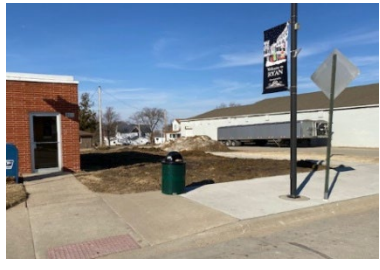
After demolition – Main Street View