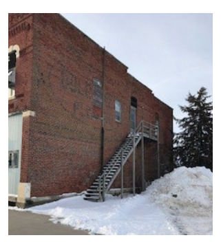
Riaht Side (East Side)

for abatement and deconstruction of the structure. Afterwards, an