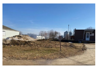
environmental consultant inspected the site and deemed it to be ready After demolition - View from Back of Property

The city obtained a grant from Future Foundation of Delaware to create a corner street park pavilion for use as a pocket neighborhood park/community gathering space for community events such as farmers market. New sidewalks have been installed on the site along a bike rack, three picnic tables, a pavilion and a bus stop. This redevelopment project was completed in the summer of 2020.