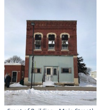
Front of Building - Main Street)