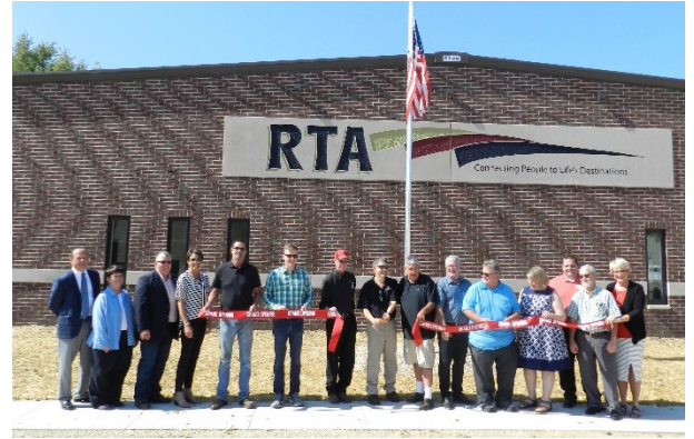
Ribbon cutting ceremony

Assessment Output: Phase I Environmental Site Assessment EPA Assessment Funding: $19,125