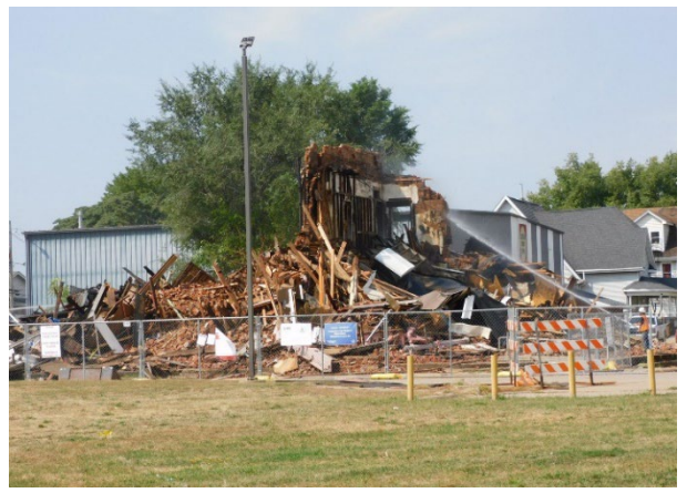
demolished immediately due to danger of possible further collapse.

August 11, 2023, the structure located at 1006-1008 S 4th St collapsed causing damage to the adjoining structures on the 1000 Block of S 4<sup>th</sup> St. A structure engineer viewed the structures and recommended that all the buildings be