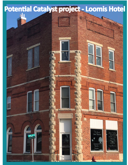
Potential Catalyst project - Loomis Hotel