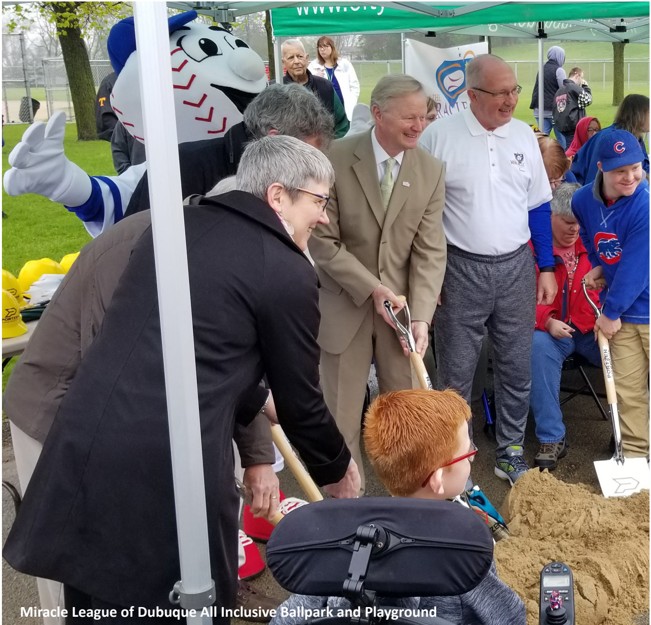
Miracle League of Dubuque All Inclusive Ballpark and Playground