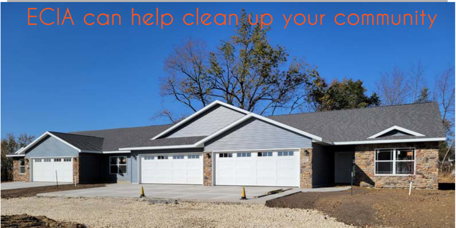
Delhi property before and after