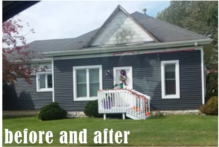
Hopkinton property before and after