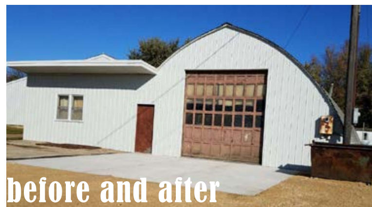
Edgewood property before and after