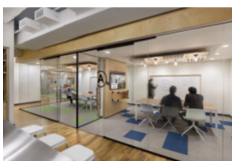
Renderings of Innovate 120 Public Facilities/ Public Spaces renovations