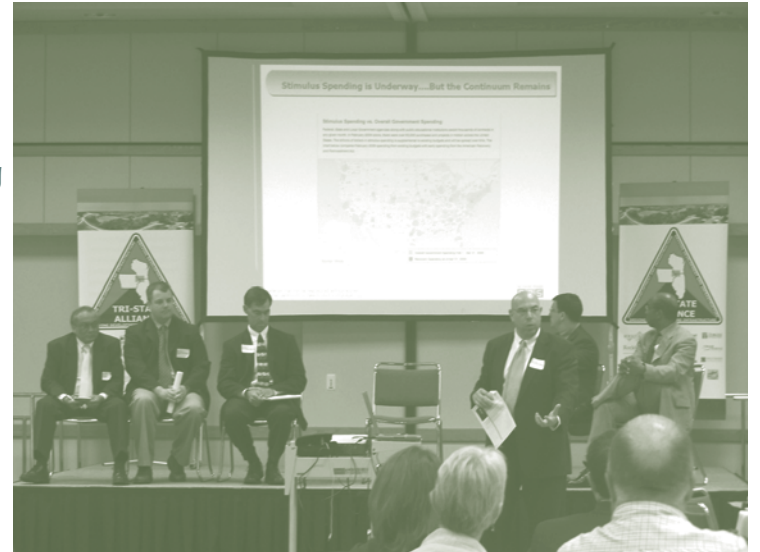
Expert panel discussion at the Tri-State Alliance Summit in May.

Mr. Skancke indicated that the Federal Highway Commission has recommended a new direction for the upcoming federal transportation bill reauthorization. They have recommended to Congress and Senate to reduce the existing 108 federal programs to 10 very efficient ones. The Commission has recommended that through the upcoming transportation bill we revolutionize the system with the following: fewer Programs; less time on project delivery; performance-driven system; create a safer system; and finally focus on freight and goods movement.