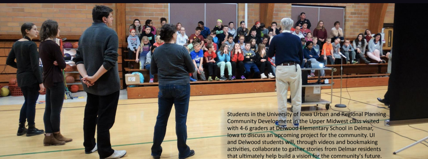
Students in the University of Iowa Urban and Regional Planning Community Development in the Upper Midwest class visited with 4-6 graders at Delwood Elementary School in Delmar, Iowa to discuss an upcoming project for the community. UI and Delwood students will, through videos and bookmaking activities, collaborate to gather stories from Delmar residents that ultimately help build a vision for the community's future.